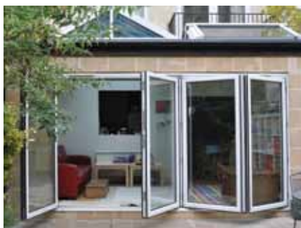
Aluminium Bi-fold Doors