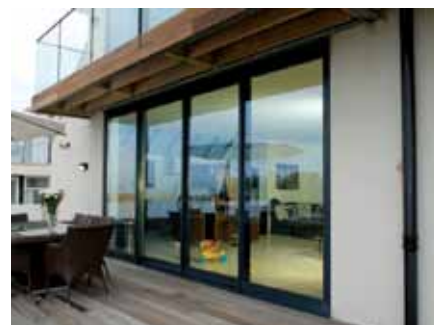
Aluminium Patio Doors

Ordering your new products Ordering your new vertical sliding windows couldn't be easier. Call one of our approved local dealers or email us at sales@sternfenster.co.uk