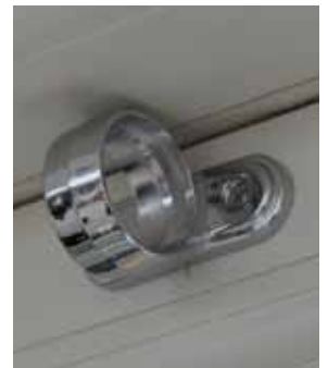
Chrome Ring Pull