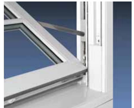
Deep Bottom Rail option

There are a wide range of options when choosing sliding sash windows. Choose a Deep Bottom Rail for added authenticity, or our Georgian Bar option which lends real character appeal. Decorative horn options reflect the elegance of traditional windows. For more information on the vertical slider range and options contact us to arrange a no pressure meeting so that we can discuss your exact requirements.