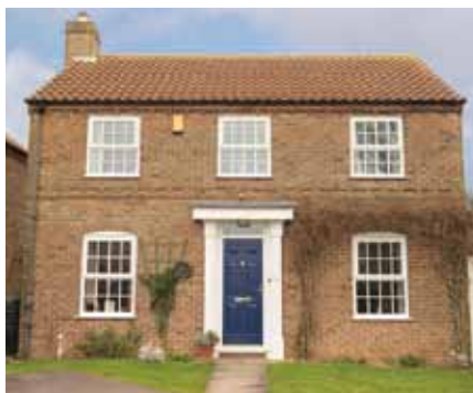
PVC Windows and Doors

With our 30 years of experience we are confident our products will enhance and add value to your home.