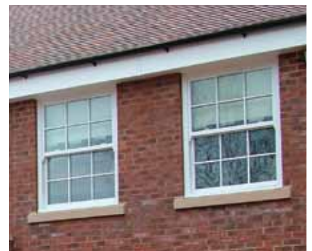
Georgian Bar option

All our dealers are regularly vetted to ensure that they are adhering to the latest survey and installation guidelines, giving you peace of mind that the product and the service will be to the highest standards.