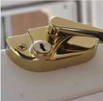
High Security Hardware